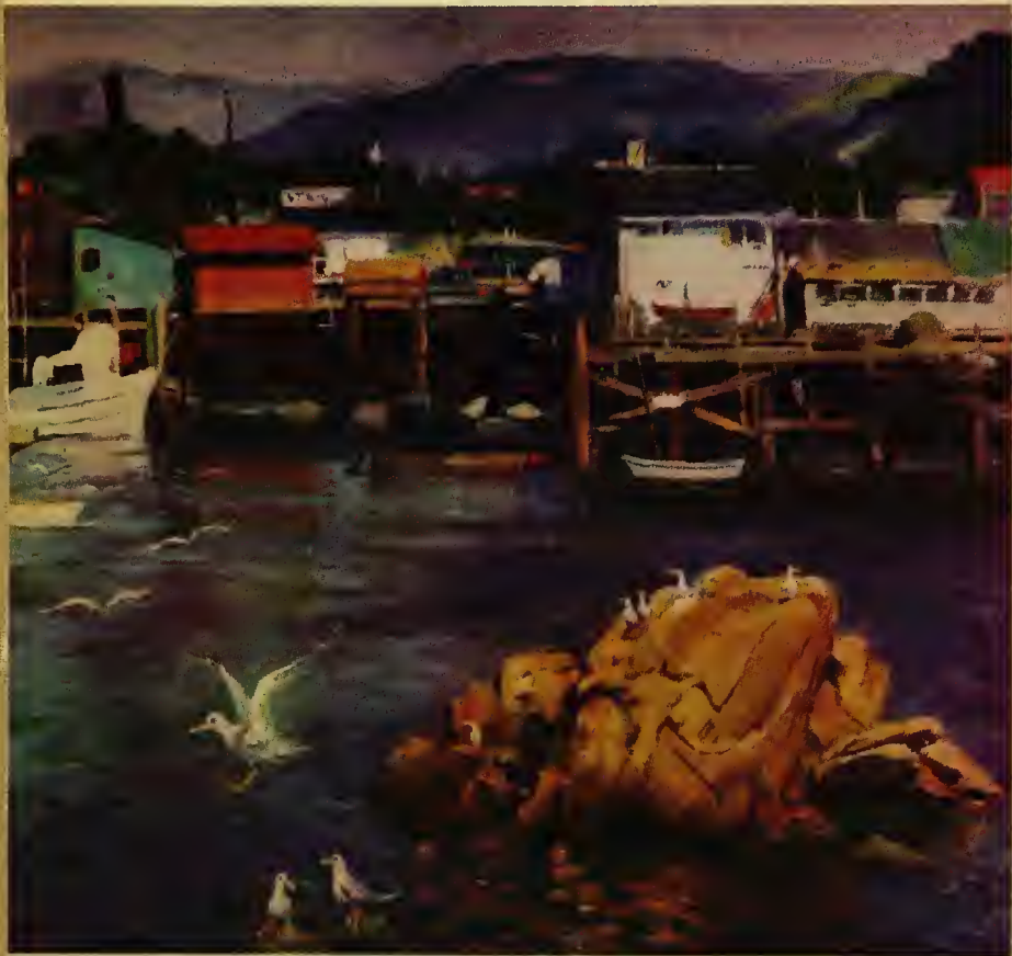
"Moon Light on Monterey Fisherman's Wharf"—Oil