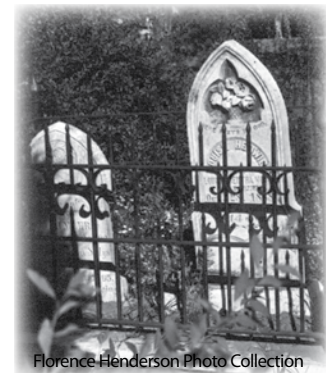
Florence Henderson Photo Collection

So was the New Helvetia Cemetery in the 1870's... twenty acres in size at its prime. Though it was dedicated in 1849 as Sutter's Burial Ground, burials preceded this date and were often shallow and marked with a wooden board. In fact, this is likely the area where burials were even before 1845, at which time it was considered the Sutter's Fort Burying Ground. This land was considered to be within the grounds of Sutter's Fort, but outside of the fort proper. The land was unfortunately subject to periodic flooding and there were no burials from late 1850-1857.