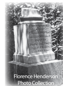
Florence Henderson Photo Collection

*Denotes those most likely moved to East Lawn Memorial Park.