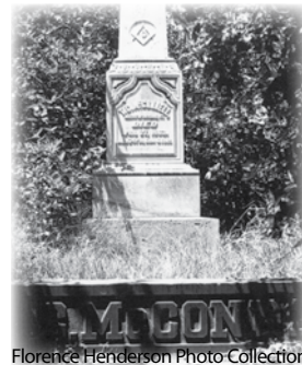
Florence Henderson Photo Collection